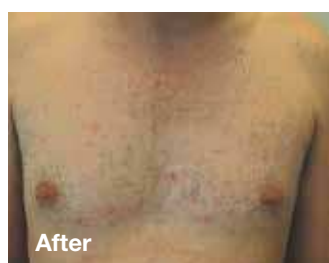
1 Month Post Tx #1