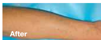
5 Weeks Post Tx #1