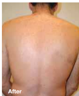
3 Weeks Post Tx #4