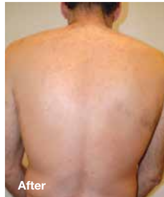
3 Weeks Post Tx #4