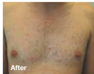
1 Month Post Tx #1