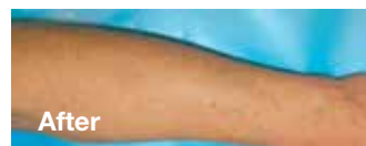
5 Weeks Post Tx #1